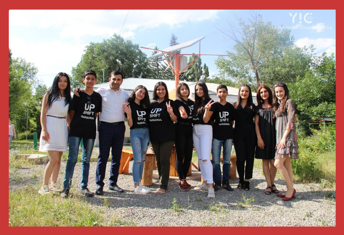
Dear readers, we are happy to present the monthly newsletter, which will tell you about our organization activities done in July.