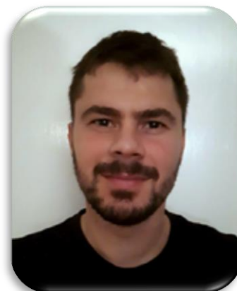
Project Coordinator Norway