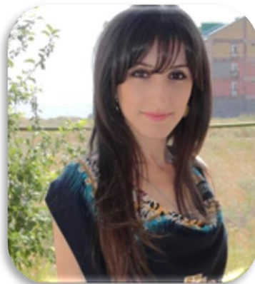
Project Coordinator Armenia